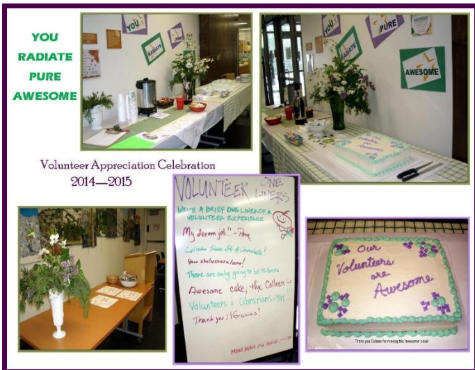
Volunteer Appreciation Celebration 2014—2015

The weather was a bit rainy and gloomy on April 24 th when we celebrated our volunteers with an intimate get-together sharing a few stories, handing out certificates, small gifts to the volunteers with the most hours, and acknowledgements of our sincere appreciation for all that they do for us. Of course we stepped it up a notch with a beautiful yummy cake made by Colleen and fresh coffee thanks to Warren!