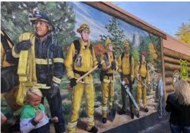
Mural on library building honoring firefighters