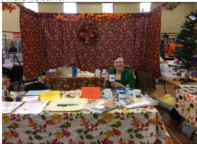
Friends of the Library Booth at Harvest Festival!