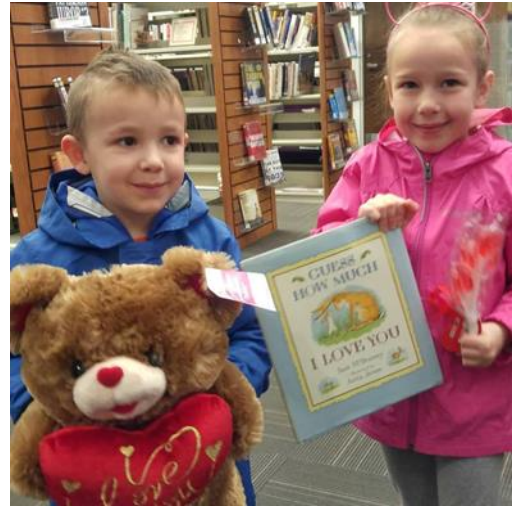
We love our library!

February, which was Library Lovers' Month. Patrons were asked to write down why they love the Idyllwild Library. We were pleasantly surprised to receive so many wonderful expressions of appreciation.